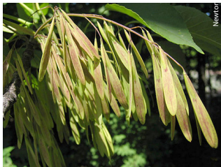
Oar-shaped seeds usually occur in clusters and hang on female trees from mid-summer until early winter.