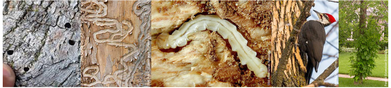
D-shaped exit holes