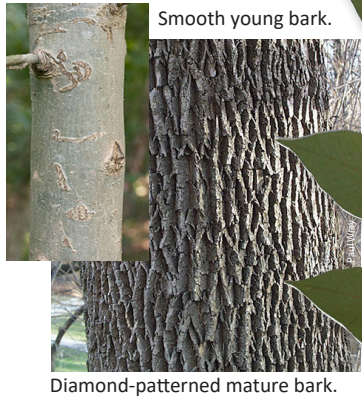
Smooth young bark.